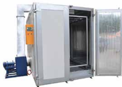
Powder Curing Oven COLO-1732