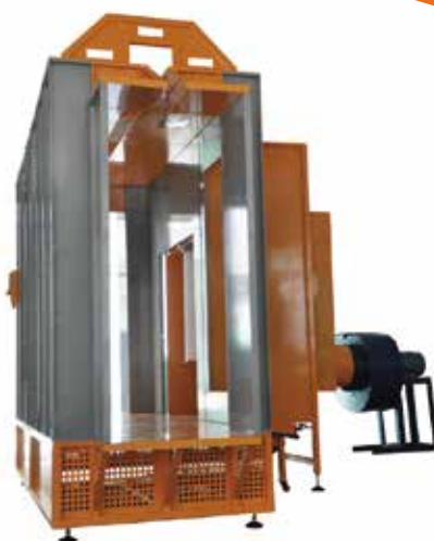
Powder Booth COLO-3212